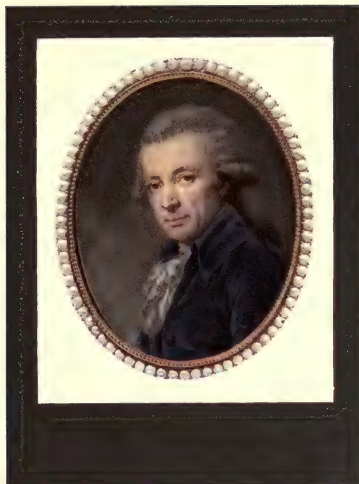
PORTRAIT OF THE ARTIST BY GIOVANNI BATTISTA DE LAMPI